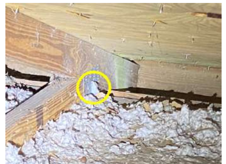
Clips w/3 nails