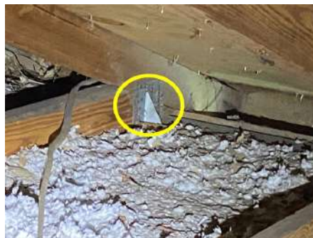
Clips w/3 nails