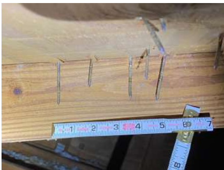
6" nail spacing